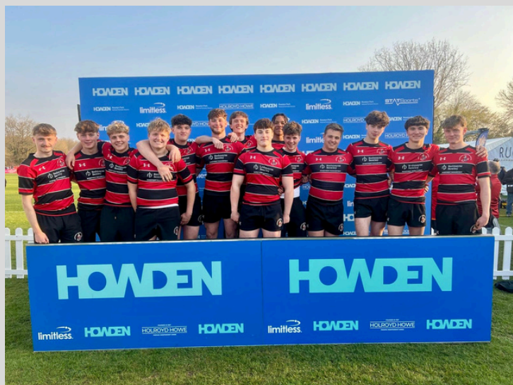
U18 Boys rugby team at Rosslyn Park