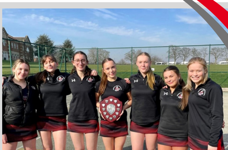
The 4th Team Senior Netball squad

Each academic year we ask if parents/carers can contribute towards the running of the school sports events. Thank you to the families who have already made a voluntary contribution. If you would like to contribute please visit the Parent Arbor App and select School Shop.