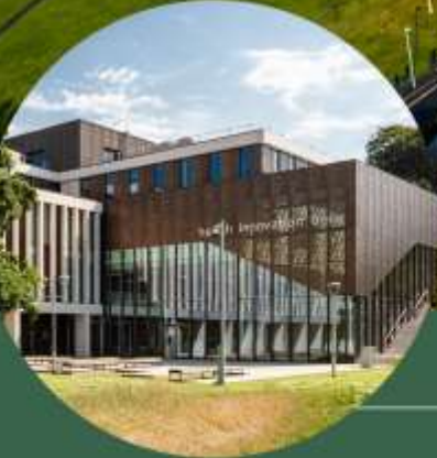
Health Innovation Campus