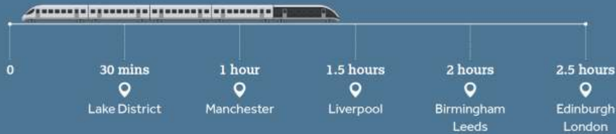
Approximate train journey times