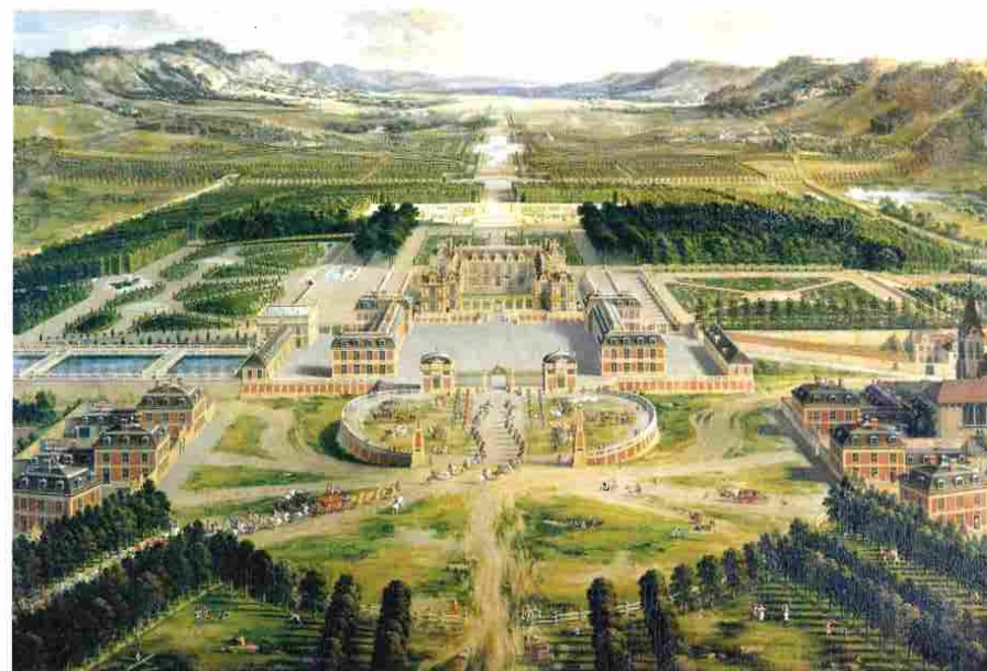
△ The Palace of Versailles at the time of Louis XVI.

These were the major high courts of appeal in France. There were thirteen of them, of which the Parlement of Paris was the most important